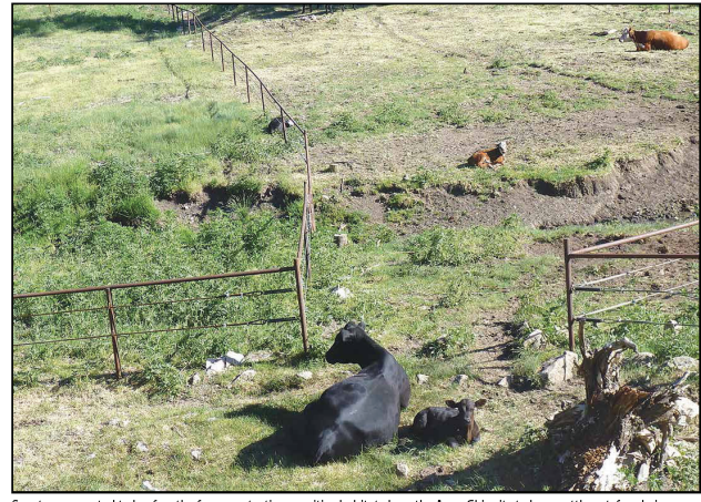
Sportsmen wanted to beef up the fence protecting sensitive habitat along the Agua Chiquita to keep cattle out, for obvious reasons. This photo was taken several weeks after the pipe fence was completed in April.

some 24 acres of riparian habitat. Cattle still have access to the stream through two "water lanes" built into the fence.